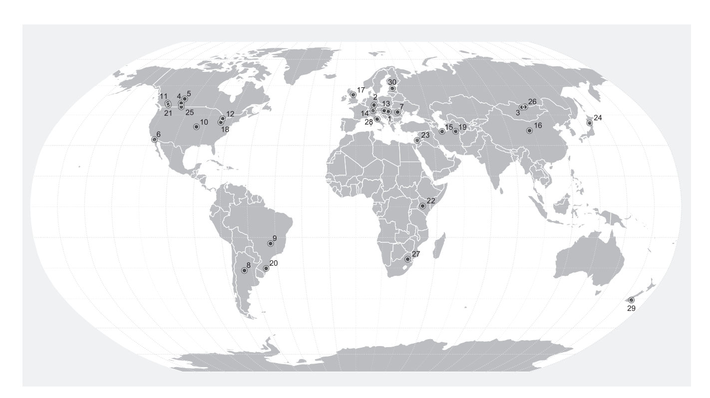
Fig. 1. Site locations. Locations of the geographic centroids of the 30 study sites, which include 151 sampling grids. Some points overlap and are therefore indistinguishable. Additional site details are provided in table S1. Map is displayed using the Robinson projection.

SCIENCE sciencemag.org 17 JULY 2015 • VOL 349 ISSUE 6245